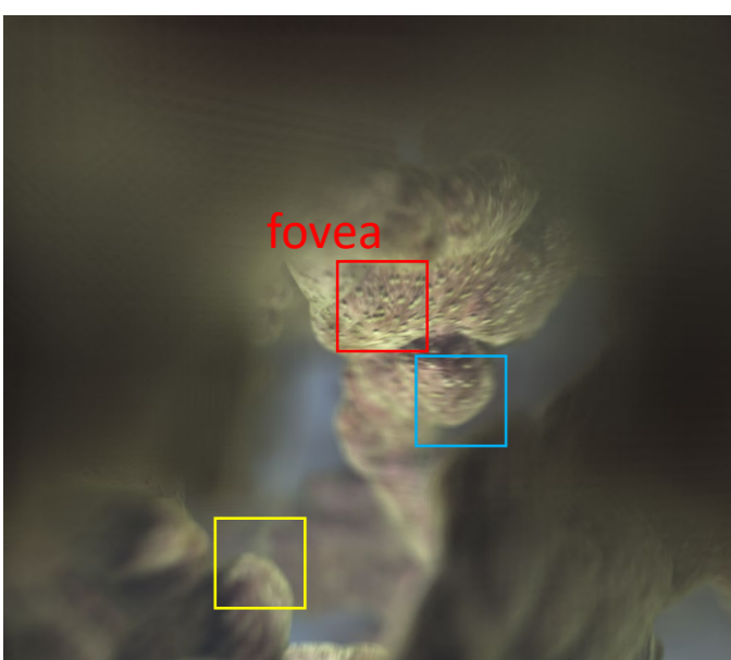
(a) original light field