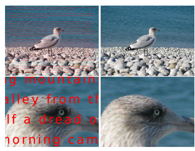
Figure 2. Inpainting example on a 12-Megapixel image. Top: Damaged and restored images. Bottom: Zooming on the damaged and restored images. (Best seen in color)