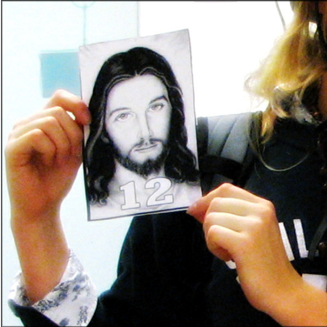
Figure 3. One of the objects to be found. Note the number in the bottom of the object - it corresponds to a number on the map aid.