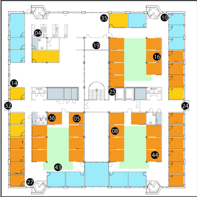
Figure 1. Map over fourth floor as used by participants.