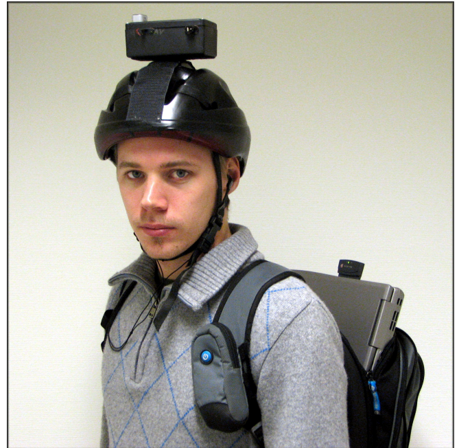
Figure 2. Hardware setup. Helmet with headtracker and backpack with laptop running all the software.

To avoid biases, all participants wore the same equipment and each participant practiced in a trial task before the actual experiment started. The order of the object targets was randomized for each participant to counterbalance systematic effects of practice. The completion time to find each object was measured and recorded.